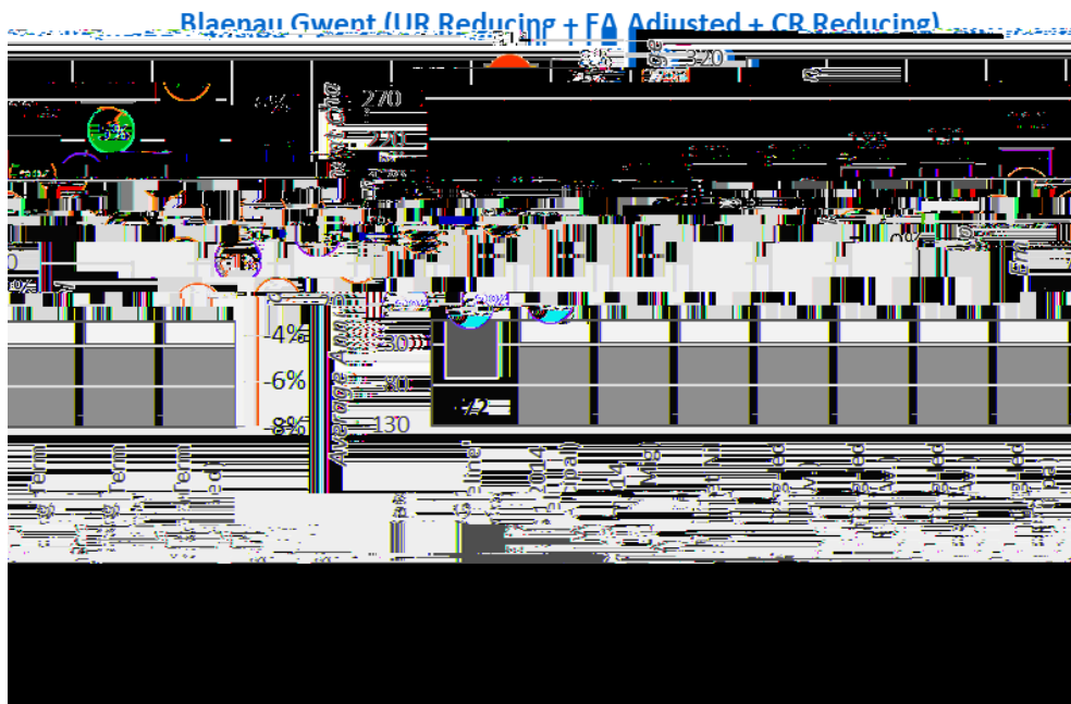
Figure 4: Blaenau Gwent 2 population and employment growth scenarios (UR reducing + EA adjusted + CR reducing)